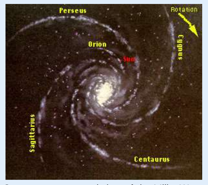
Computer generated view of the Milky Way

Recently we have had quite a few new members and potential new members who I would like to welcome and to thank for their interest. I hope to see as many people as possible in the remaining sessions this year.